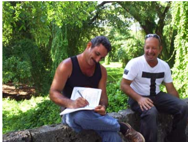
Pilots signing the Record book