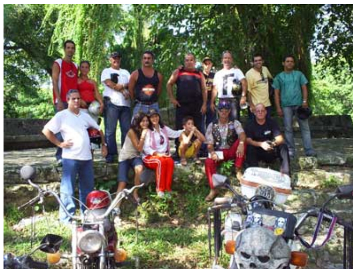
Founders of the project

http://motosclasicascuba.havanatrends.com/motosclasicascuba/especial_medioambiente.htm