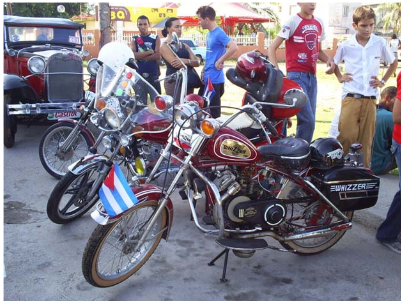
Beach of 16, September 19, 2009