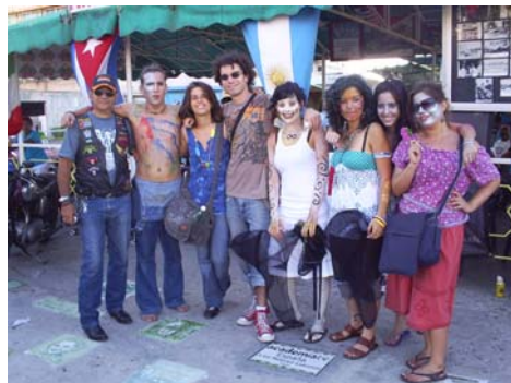
New environmentalist youths that unite to the project