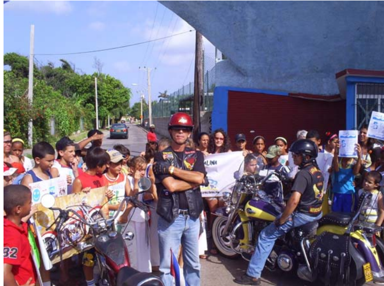
Environment officer welcomes the participants