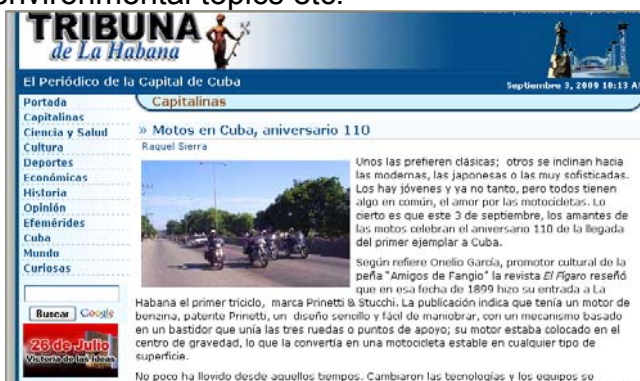
First Expo of "Bikes in Cuba" august 2009

See: http://www.tribuna.co.cu/etiquetas/2009/septiembre/3/motos-cuba.html