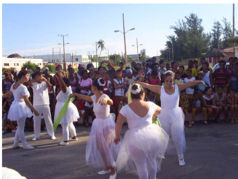
Members of the project "Looking for my space" perform on 110 Beach

See: http://hobbiesenred.havanatrends.com/hobbiesenred/medioambiente.html