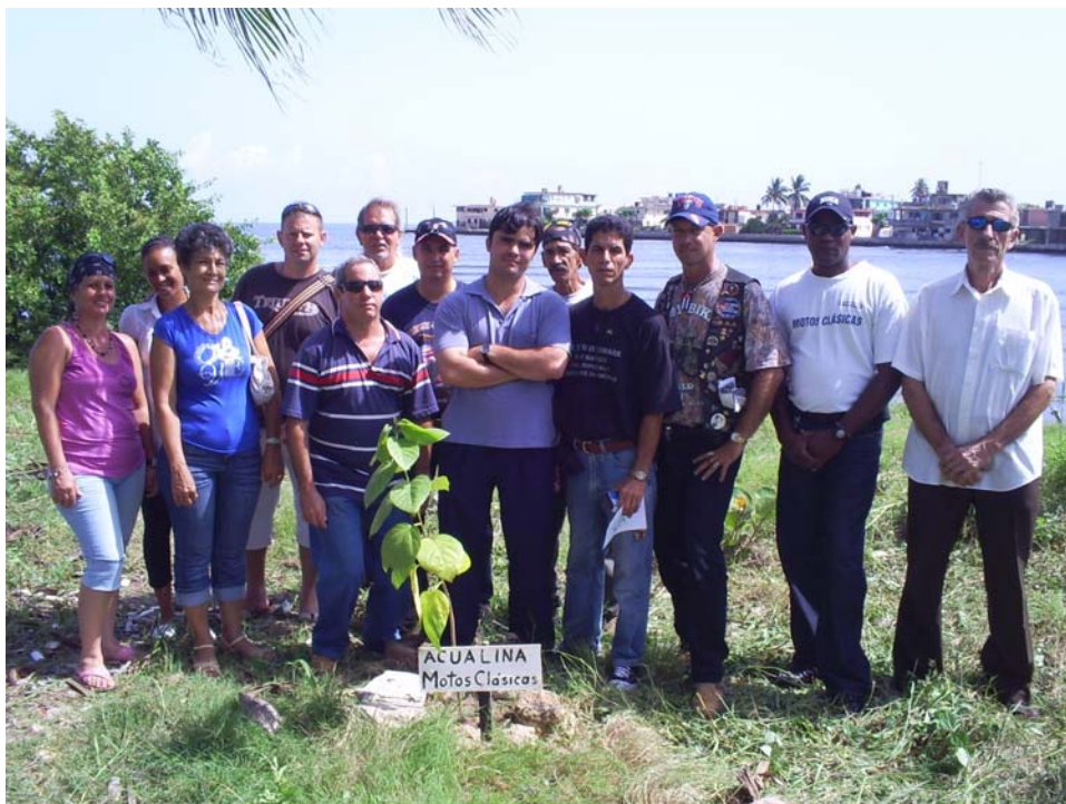
Quibú river outlet planting trees