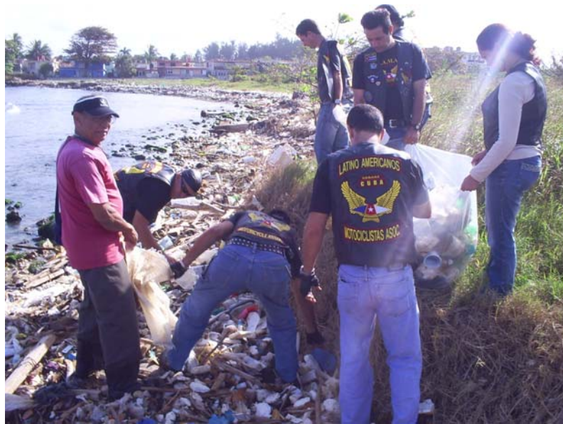
Bikers in the collection of solid wastes